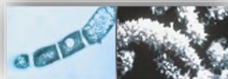
Saccharopolyspora spinosa (left) and S. spinosa entom (right)

➤ An indispensable pest control solution for both conventional and organic farmers in Europe, meeting societal demand for natural origin solutions and a more resilient and sustainable EU agriculture