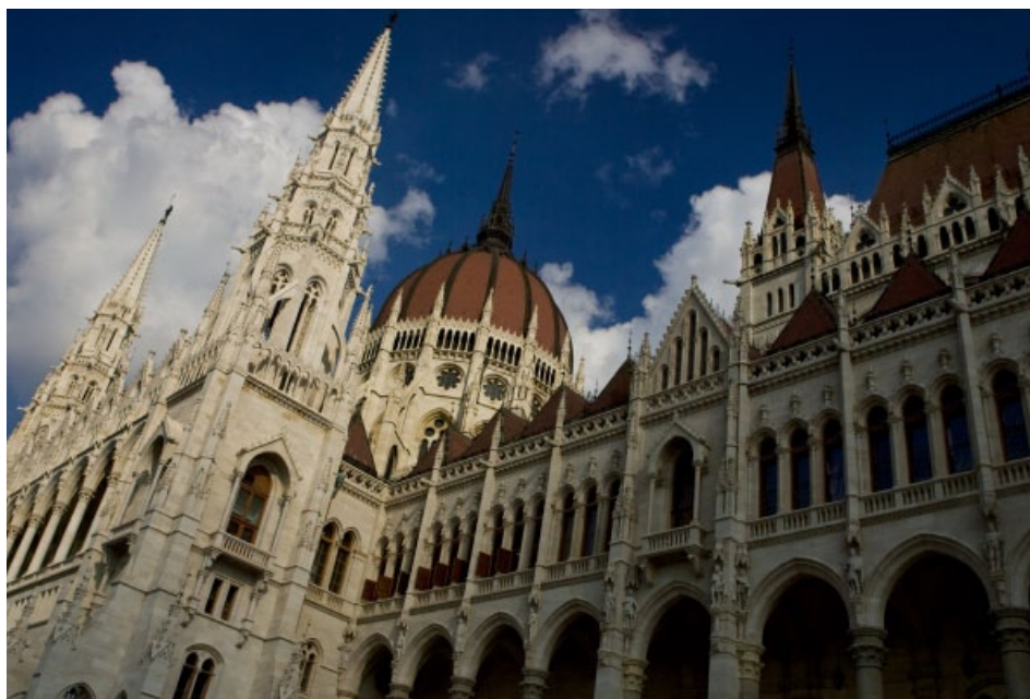
The Hungarian Parliament

We provide one of the bridges between citizens and their representatives across which they can express themselves in writing and receive replies. The purpose of the review is to give an insight into the issues that were preoccupying citizens who wrote to our Unit.