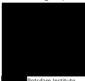
Potsdam Institute for Climate Impact Research