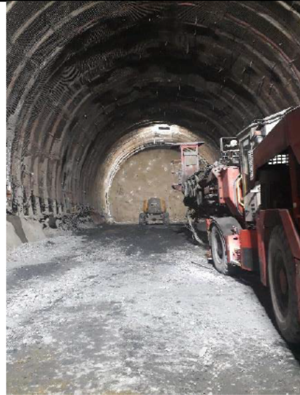
22/01/2020: ongoing works