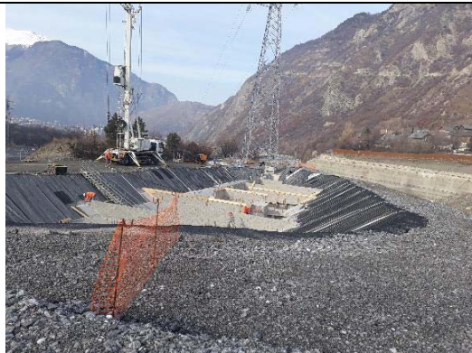
Water treatment basin