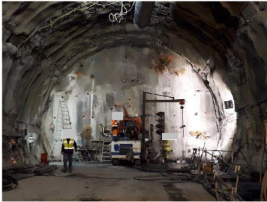
17/11/2017: Excavation at section 3b