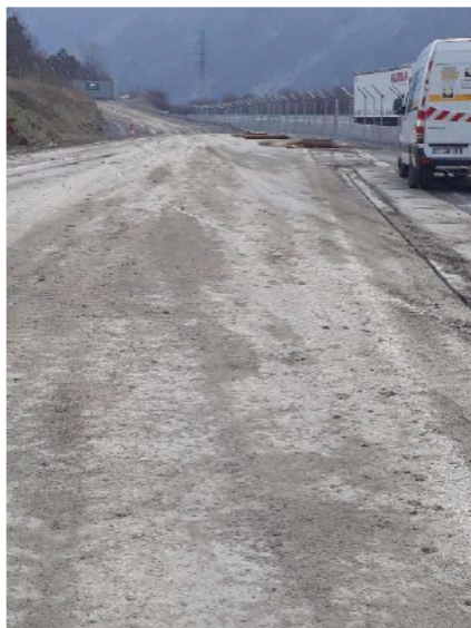
A43 motorway deviated