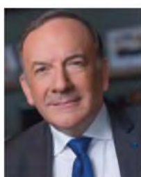
Pierre Gattaz President

The future is built today and we stand ready to work on it.