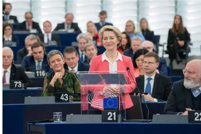
Ursula von der Leyen President of the European Commission