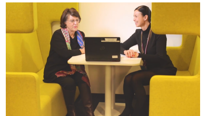
Info sessions for MEPs

As the current term draws to an end, the MEPs' Portal offers Members individual, tailor-made information sessions regarding their financial and social entitlements, with practical and personalised guidance. To guarantee confidentiality and data protection, these information sessions will be provided to Members only. For information on how to request an info-session, please see Notice 42/2018 . Moreover, open info-sessions for outgoing Members will also be organised by Parliament's administrative services. Members will be informed per e-mail.