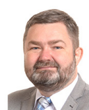
Karol Karski (ECR, PL)