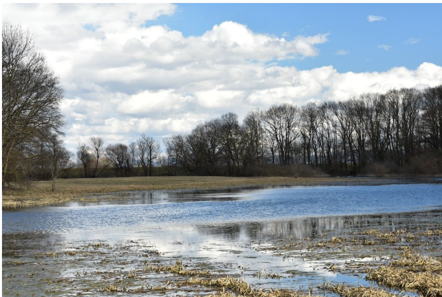
Morava floodplain