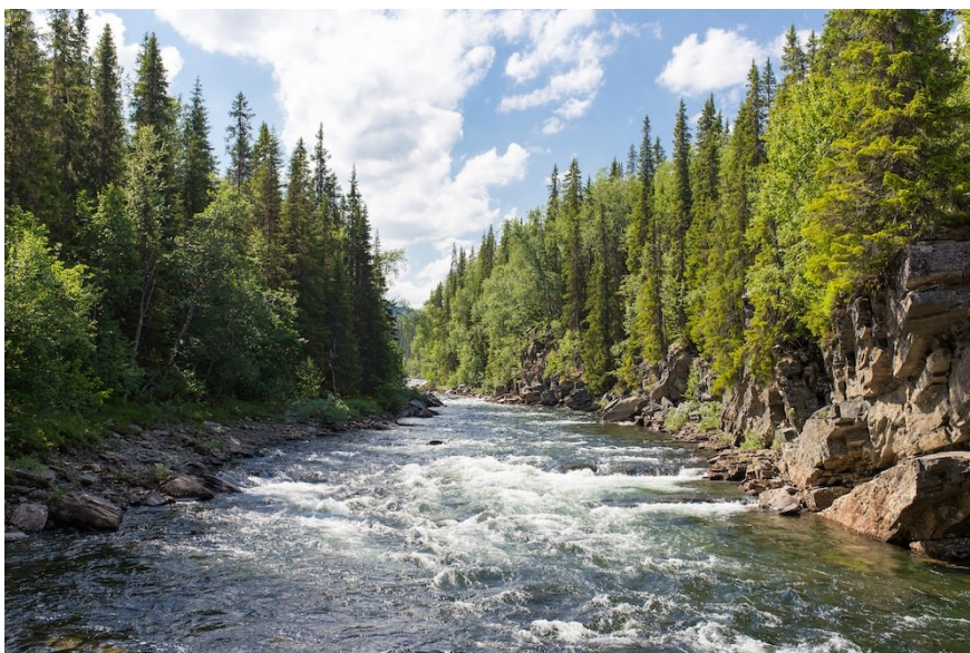
Gäddede, Sweden

A significant number of these man-made river barriers could be removed, as they are no longer useful (obsolete barriers). The reconnected reaches combined with other river restoration measures can serve as habitats to restore the populations of several fish and other species.