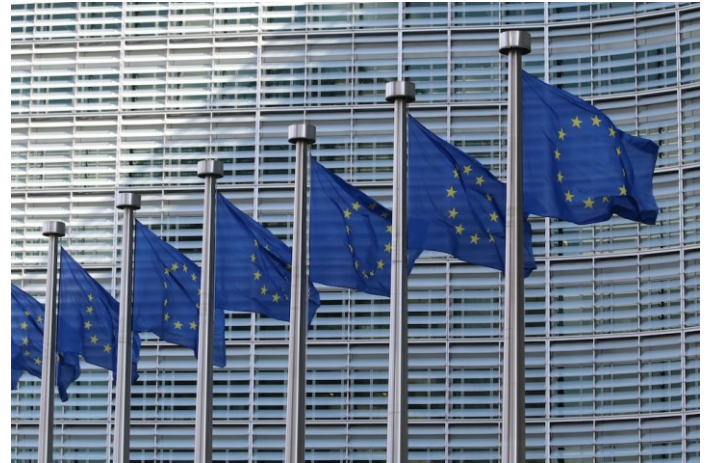
Brussels, Belgium

EU funds have the scope to cover a large proportion of the funding needs. Under the 2021-2027 Multiannual Financial Framework (MFF), estimates for allocations to biodiversity amount to nearly EUR 114 billion 2 (approximately EUR 16 billion annually) [1]. The €16 billion annual biodiversity spending available under the MFF could therefore cover a large part of the annual restoration costs of €8.2 billion (see Annex 1).