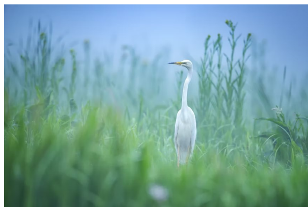
Tulcea, Romania, Photo by Dedu Adrian

The Biodiversity Strategy to 2030 states that biodiversity actions will require at least €20 billion per year stemming from private and public funding at national and EU level [2]. Mobilising funding for restoration is therefore part of a wider effort to fund actions for biodiversity up to 2030.