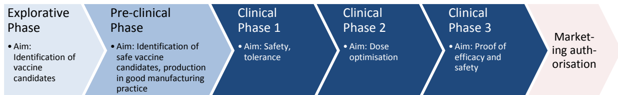
Figure 1: Overview of the phases of vaccine development

After producing a potential vaccine candidate in the research laboratory, initial animal and cell culture experiments are conducted to assess whether, in addition to its tolerability, it is suitable for producing a protective effect against the target pathogen or the infectious disease caused by it, where an animal model exists for this purpose. Subsequently, toxicological and pharmacological properties are evaluated in various animal models. Only when there is no doubt as to its safety for use on humans is a first clinical trial performed to assess its safety on healthy human adult volunteers (Phase 1). In the subsequent clinical trial phases , the optimal dosage and vaccination schedule are tested in a larger number of volunteers (several hundred) (Phase 2) and then the efficacy and side-effect profile of the vaccine are determined in a large, randomised, controlled clinical study (Phase 3) with several thousand volunteers from different age groups.