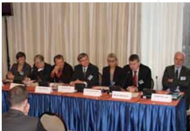
Hearing Katowice - October 2009

The other example is the WG on civil society and was an initiative from the sector itself in 2008. It focusses the effective application of the partnership principle. OFOP ( Ogólnopolska Federacja Organizacji Pozarządowych ), the Polish Federation of NGOs, has the chair. This WG develops partnership mechanisms, also assessing the procedures for appointing members to the MCs, intervenes where there is an insufficient level of partnership and follows up on equal opportunities and sustainable development. It also organises training for partnership members of the monitoring committees.