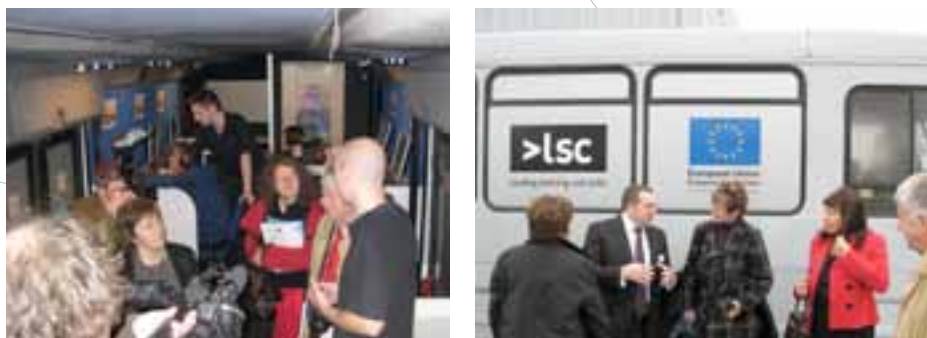
'Makin Trax' is a project aimed at pupils in Year 10 (±15/16 year-olds) in the Birmingham area who are multiple offenders with a persistent police history. The objective of the project is to rekindle the pupils' interest in school and to enable them to acquire a Duke of Edinburgh Skills Award in music technology within a traditional school environment. A specially adapted creative-learning bus is itself an incentive for pupils who want to complete their training; the project has become a phenomenal success and receives ESF co-financing.

The Learning and Skills Councils (LSCs) , Regional development agencies (RDAs) and local authorities have been key public actors, all working in partnership with the private sector. It should be noted that regional ESF committees have the opportunity to take on board representatives "agreed by the regional partnership". From 2010, the Skills Funding Agency has taken over from the LSC regarding its ESF activities; it also works together with the new Young Peoples' Learning Agency (YPLA) . The RDAs will cease to exist beyond March 2012 and economic development will be led by Local Enterprise Partnerships (LEP) . Local Authorities and business leaders currently have the opportunity to propose where and how LEPs should be created.